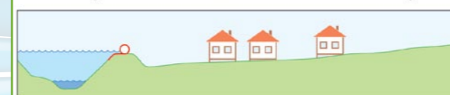
Adding height to existing levees