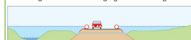
Keeping essential roads open to traffic