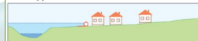
Protecting residential areas and other crucial objects